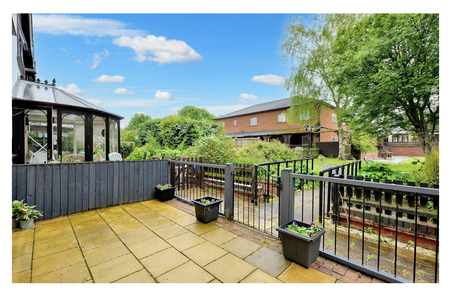
AN IMMACULATE TWO DOUBLE BEDROOM GROUND FLOOR APARTMENT BEING SOLD WITH THE BENEFIT OF NO UPWARD CHAIN.

It gives Robert Ellis great pleasure to bring to the market a property which has been refurbished by the current owners and now offers a lovely open plan living space with a modern kitchen having built-in appliances and patio doors onto the courtyard garden. We believe it will make an ideal retirement or downsize property which you can move straight in to and an internal viewing is a must to fully appreciate all the accommodation has to offer.