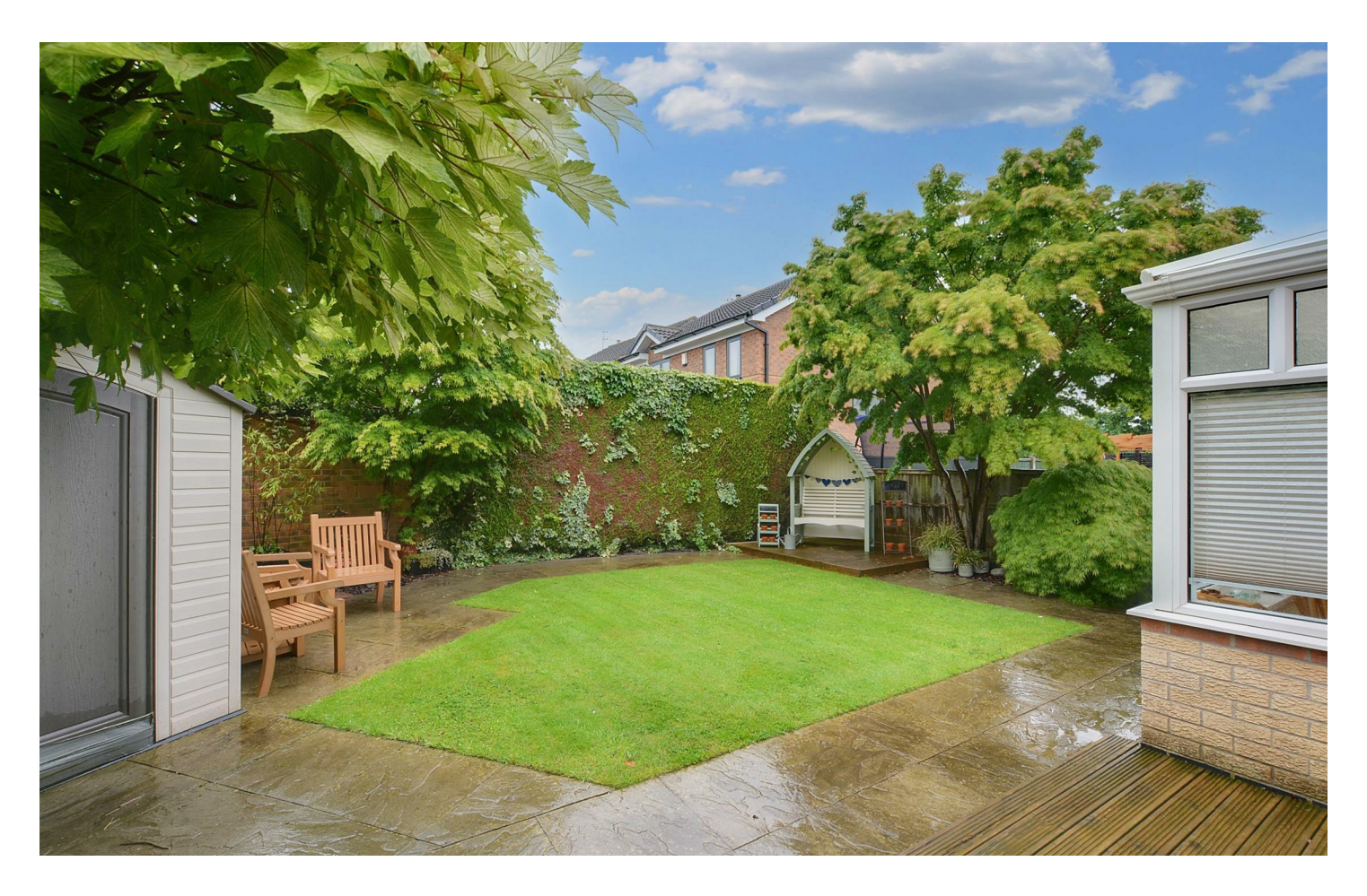
THIS IS A THREE BEDROOM DETACHED PROPERTY ORIGINALLY BUILT BY DAVID WILSON HOMES, WHICH IS LOCATED IN THIS MOST SOUGHT AFTER RESIDENTIAL AREA ON THE OUTSKIRTS OF LONG EATON.

Robert Ellis are pleased to be instructed to market this three bedroom detached property which was originally built by David Wilson Homes and has an attractive appearance to the front and a very private garden to the rear, all of which we are sure will appeal to people looking for a family home in the Long Eaton area. For the size and quality of the accommodation and privacy of the rear garden to be appreciated, we recommend that interested parties do take a full inspection so they are able to see all that is included in this lovely home for themselves. The property is well placed for excellent local schools and various transport links, all of which has helped to make this a very popular and convenient place to live.