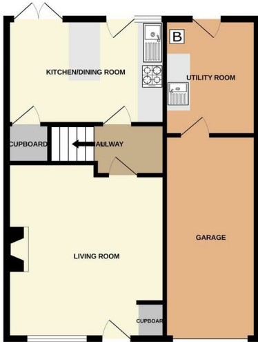
GROUND FLOOR 622 sq.ft. (57.8 sq.m.) approx.