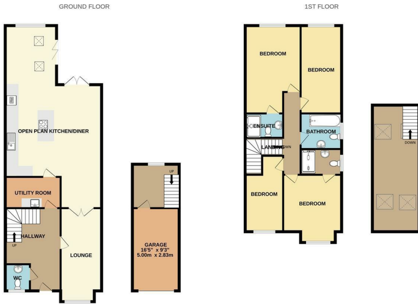
10 DOVE LANE, LONG EATON

While every attempt has been made to ensure the accuracy of the floorplan contained here, measurements of doors, windows, rooms and any other items are approximate and no responsibility is taken for any error, omission or mis-statement. This plan is for illustrative purposes only and should be used as such by any prospective purchaser. The services, systems and appliances shown have not been tested and no guarantee as to their operability or efficiency can be given. Made with Metropix CS024