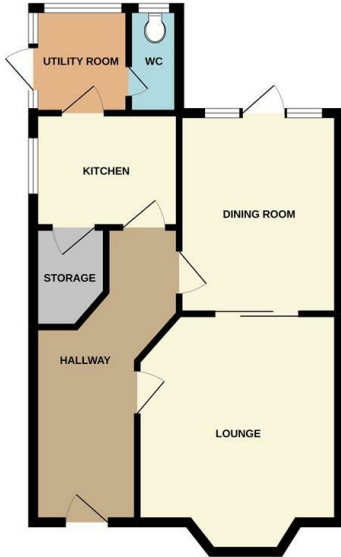
GROUND FLOOR 504 sq.ft. (46.9 sq.m.) approx.