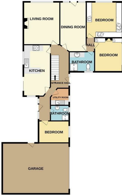
GROUND FLOOR 1629 sq.ft. (159.9 sq.m.) approx.