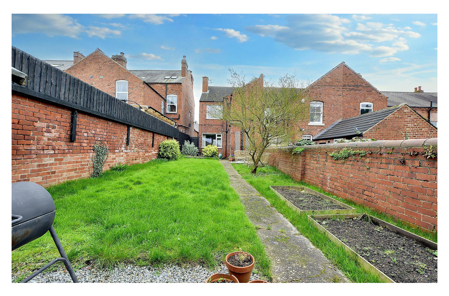
ROBERT ELLIS ARE DELIGHTED TO MARKET THIS EXTREMELY WELL PRESENTED, TURN OF THE CENTURY TRADITIONAL BAY FRONTED THREE BEDROOM DETACHED HOUSE BEING SOLD WITH NO UPWARD CHAIN!

A stunning THREE bedroom detached property with a large dual aspect lounge diner ideal for entertaining. Beautifully presented throughout with a kitchen which is open plan to the dining room and also has a ground floor w.c for convenience for your guests. The Minton tiled floor to the entrance hall is not to be missed and the property is packed full of period features such as architraving, coving and cornicing. Mixed with the period, the property has a modern twist, with neautral decor, an elegant kitchen and up-to-date bathroom and benfitting from oak internal doors throughout.