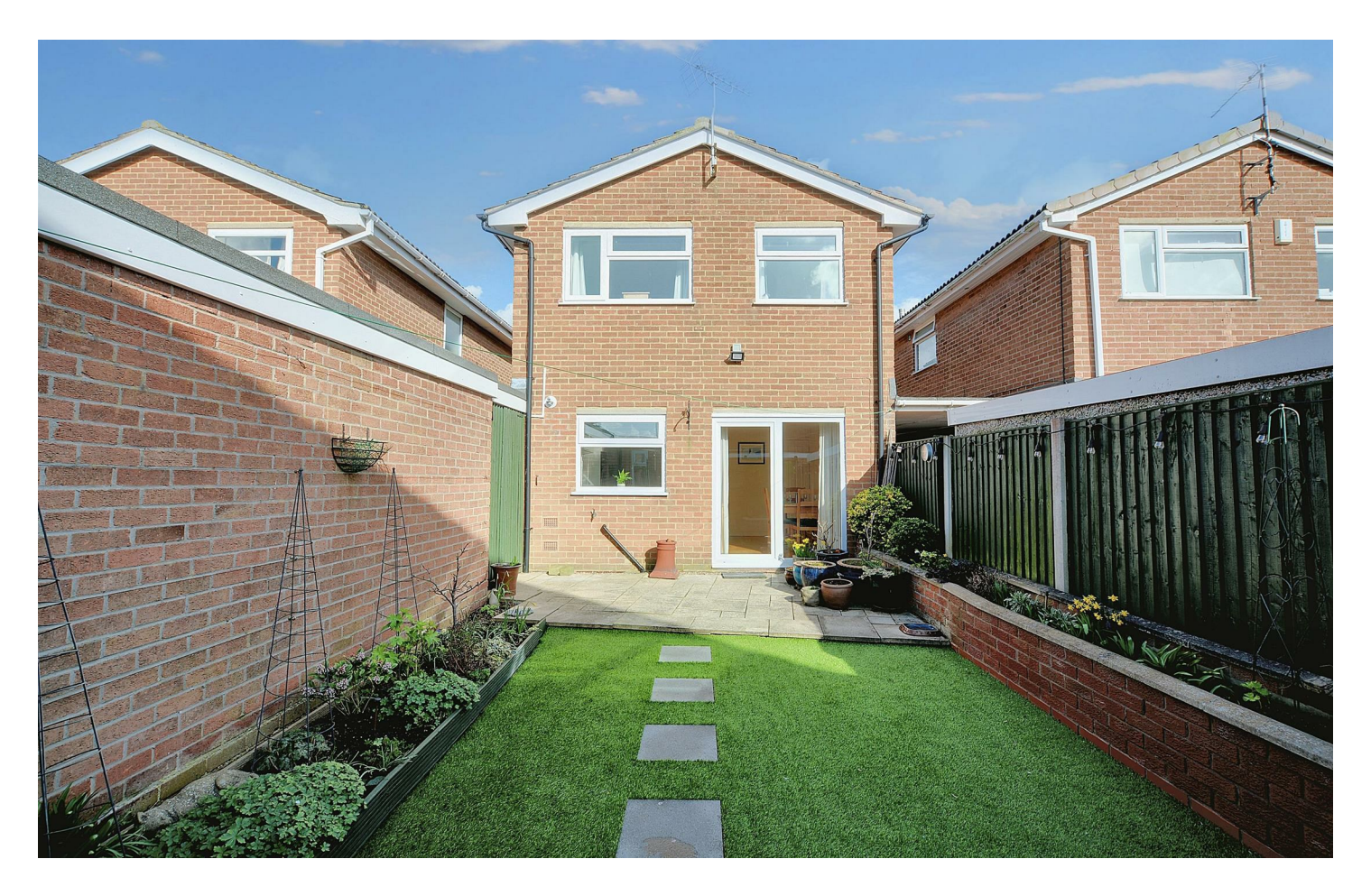
THIS IS A GABLE FRONTED, FOUR BEDROOM DETACHED FAMILY HOME SITUATED CLOSE TO THE CENTRE OF THIS AWARD WINNING VILLAGE AND BEING SOLD WITH NO UPWARD CHAIN.

Robert Ellis are pleased to be instructed to market this detached family home which is situated on Holmes Road and is therefore close to all the amenities provided by Breaston village as well as being close to other amenities and facilities found in nearby Long Eaton and to excellent transport links. For the size of the accommodation and privacy of the rear garden which has the garden room/home office to be appreciated, we do recommend that interested parties take a full inspection so they are able to see all that is included in this lovely home for themselves.