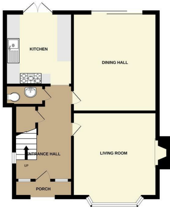
GROUND FLOOR 537 sq.ft. (49.9 sq.m.) approx.