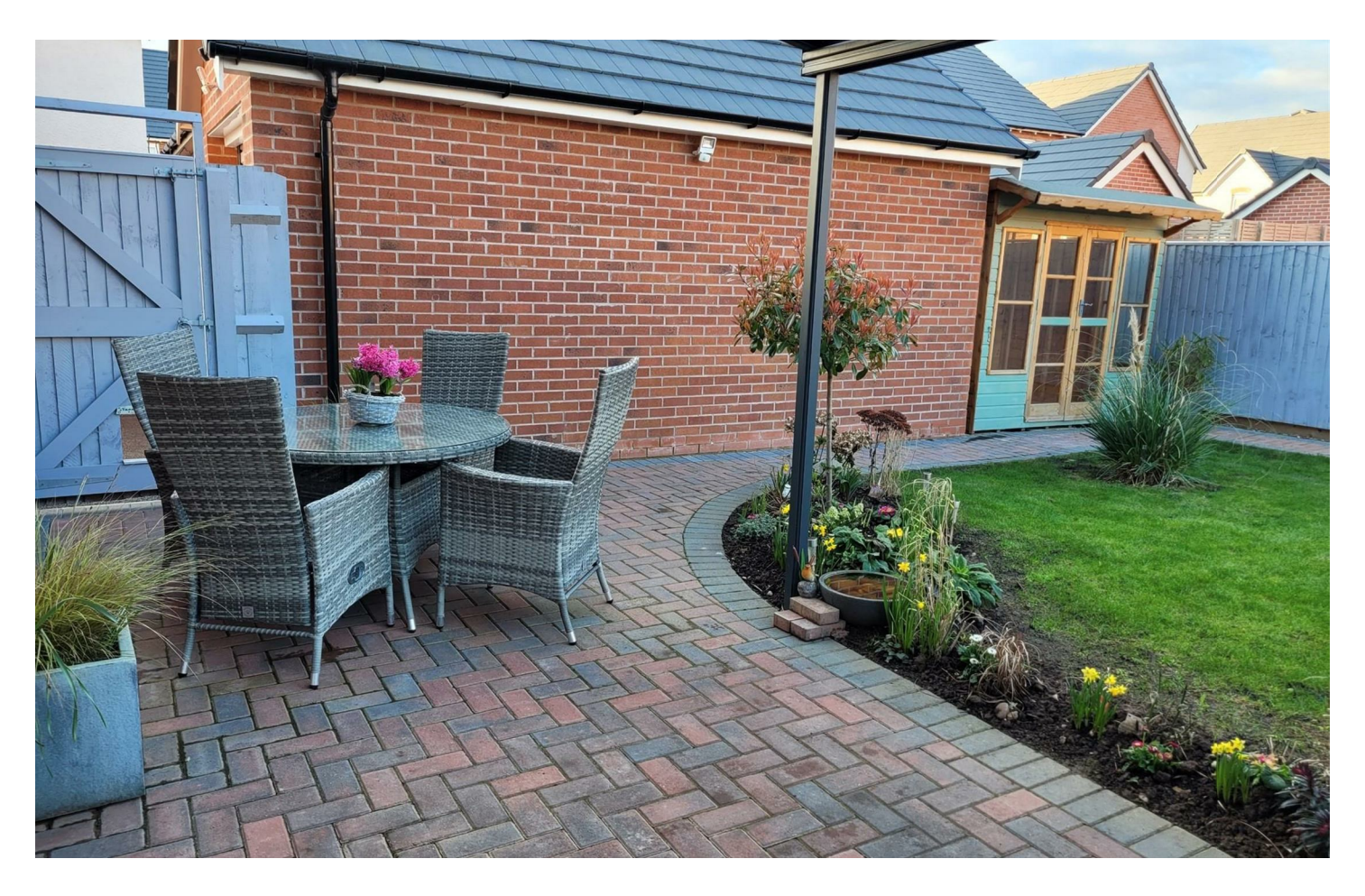
THIS IS AN ATTRACTIVE, ALMOST BRAND NEW FOUR BEDROOM DETACHED HOUSE HAVING A DETACHED GARAGE AND PRIVATE GARDEN TO THE REAR.

Being situated on Huffer Road, which is within the Crest Nicholson development on the outskirts of Kegworth, this lovely home is ready for immediate occupation and still has a brand new show house feel and for the size of the accommodation and privacy of the rear garden to be appreciated, we recommend that interested parties do take a full inspection so they can see all that is included in this lovely home for themselves.