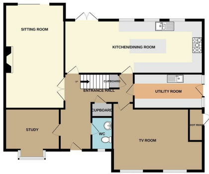
GROUND FLOOR 1296 sq.ft. (120.4 sq.m.) approx.