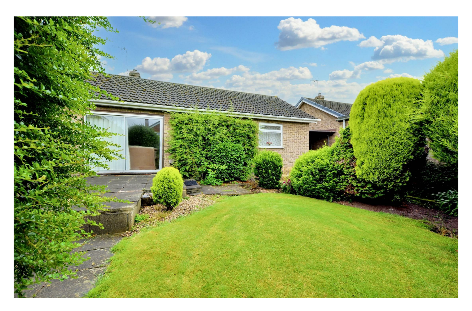
A TWO DOUBLE BEDROOM DETACHED BUNGALOW FOUND ON A QUIET, SOUGHT AFTER CUL-DE-SAC IN SANDIACRE, BEING SOLD WITH THE BENEFIT OF NO UPWARD CHAIN.

Robert Ellis are delighted to bring to the market this detached bungalow, being sold with NO UPWARD CHAIN. The property is constructed of brick and benefits from gas central heating, double glazing throughout, driveway, double car port and detached single garage with enclosed rear garden.