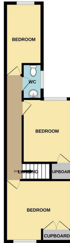
1ST FLOOR 443 sq.ft. (41.2 sq.m.) approx.