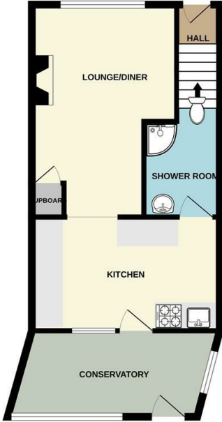
1ST FLOOR 350 sq.ft. (32.5 sq.m.) approx.