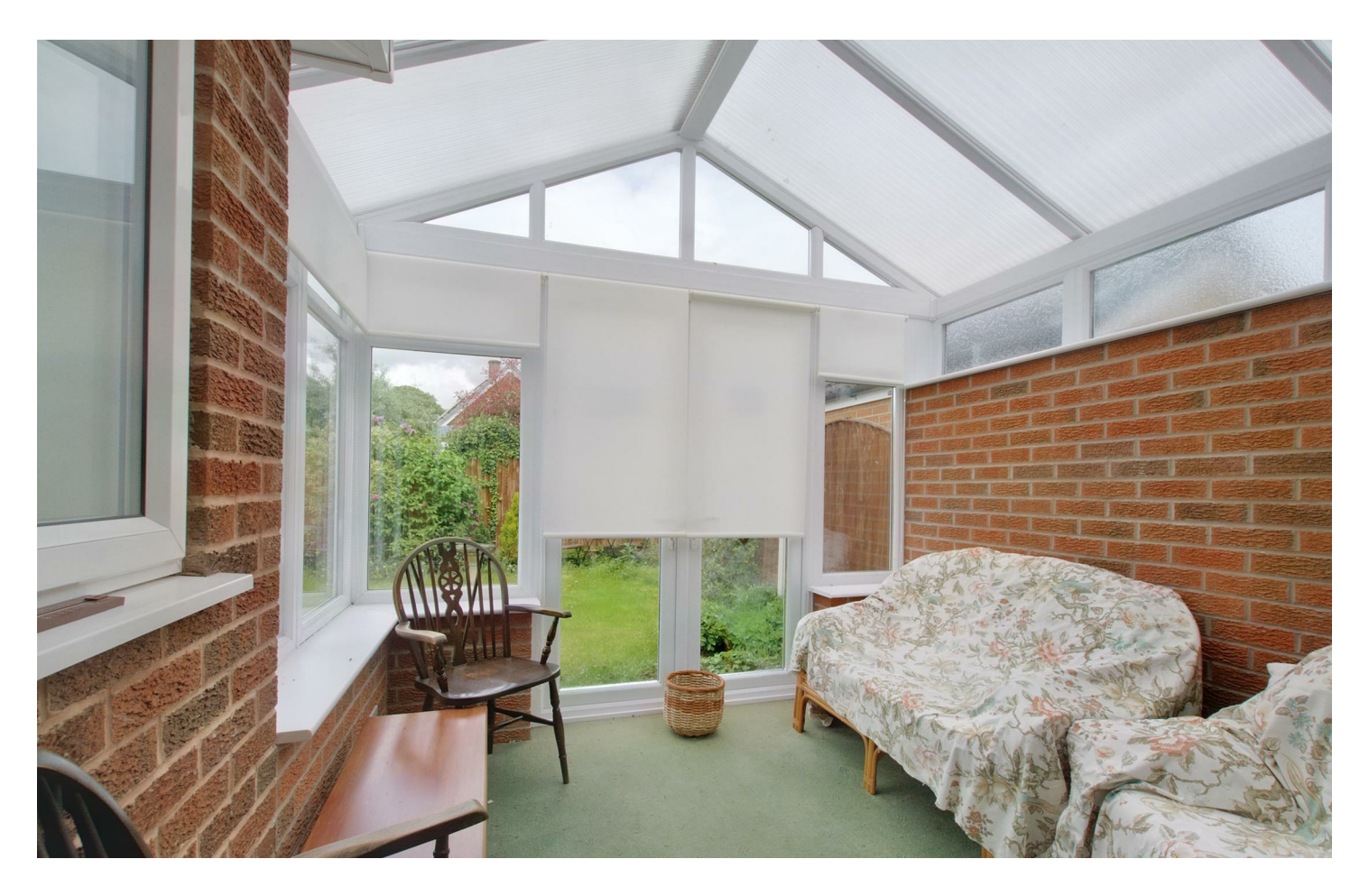
THIS IS A GABLE FRONTED CHALET STYLE THREE DOUBLE BEDROOM PROPERTY SITUATED IN THIS MOST SOUGHT AFTER SEMI RURAL LOCATION.

Being located on Holly Avenue, this detached chalet style property offers flexible accommodation which can either have three bedrooms or an additional reception room to the ground floor. The property is being sold with the benefit of NO UPWARD CHAIN and we recommend that interested parties do take a full inspection so they are able to see the full extent of the accommodation and the privacy of the rear garden for themselves. The property is well appointed throughout with the kitchen and bathroom up to date and the property is therefore ready for immediate occupation without a new owner having to carry out any works whatsoever. The property is well placed for easy access to the amenities and facilities provided by Breaston as well as those in Long Eaton and to excellent transport links, all of which have helped to make this a very popular and convenient place for people to live.