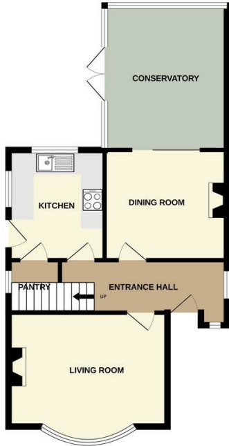
GROUND FLOOR 596 sq.ft. (55.4 sq.m.) approx.