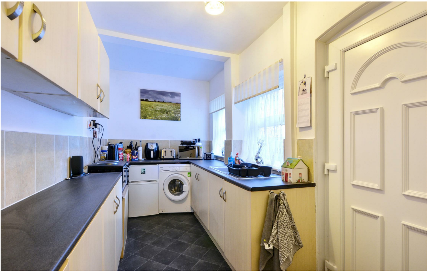
A surprisingly spacious two double bedroom mid terraced house.

This well presented property comes to the market in a ready to move into condition with features including uPVC double glazed windows and gas fired central heating served from a combination boiler which was only installed in the Summer of 2025 and has a five year warranty.