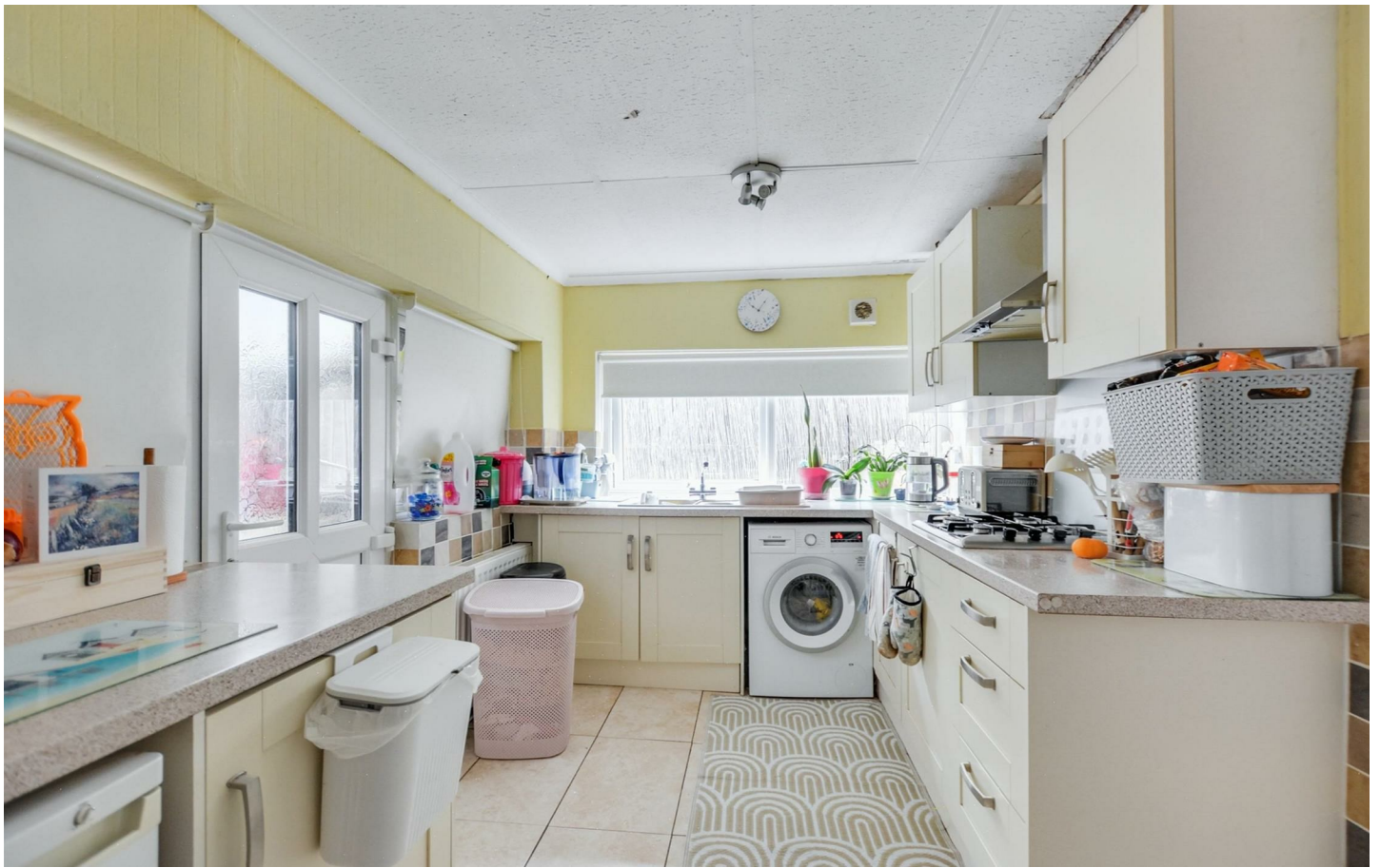
A traditional bay fronted three bedroom semi detached house.

The current owners have improved the property over the years with a replacement roof, replacement uPVC double glazed windows, upgraded electrics, upgraded the central heating with a gas combination boiler and had a conservatory built in 2017 which benefits from electric underfloor heating.