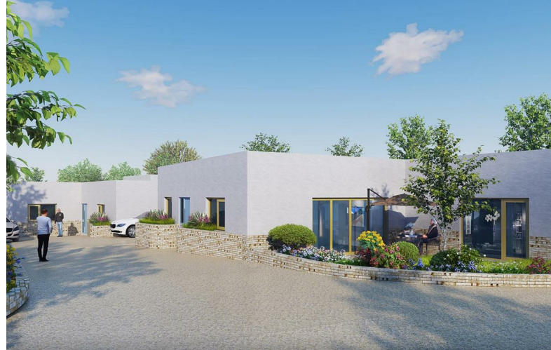
**FOR SALE BY AUCTION ON 31ST JULY 2025** **REGISTER TO BID WITH SDL/EDDISON**

SITE WITH FULL GRANTED PERMISSION FOR FOUR DWELLINGS!