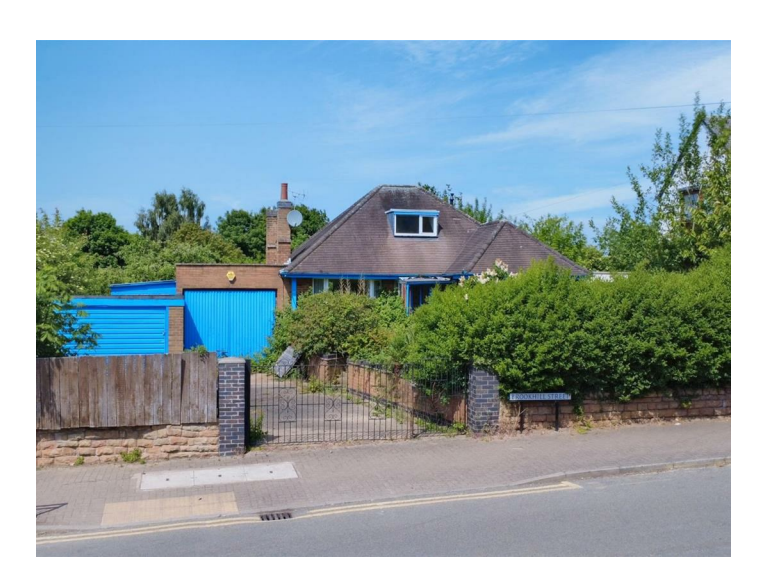
**FOR SALE BY AUCTION ON 3 IST JULY 2025** **REGISTER TO BID WITH SDI /EDDISON**