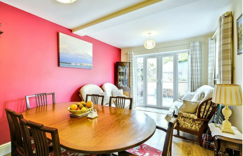
Ilkeston Road Trowell, Nottingham NG9 3PX