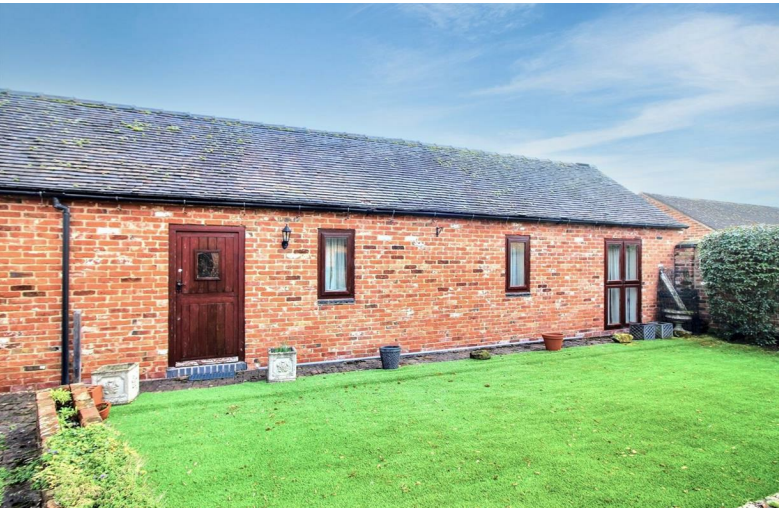
Manor Court, Risley, Derby DE72 3SS