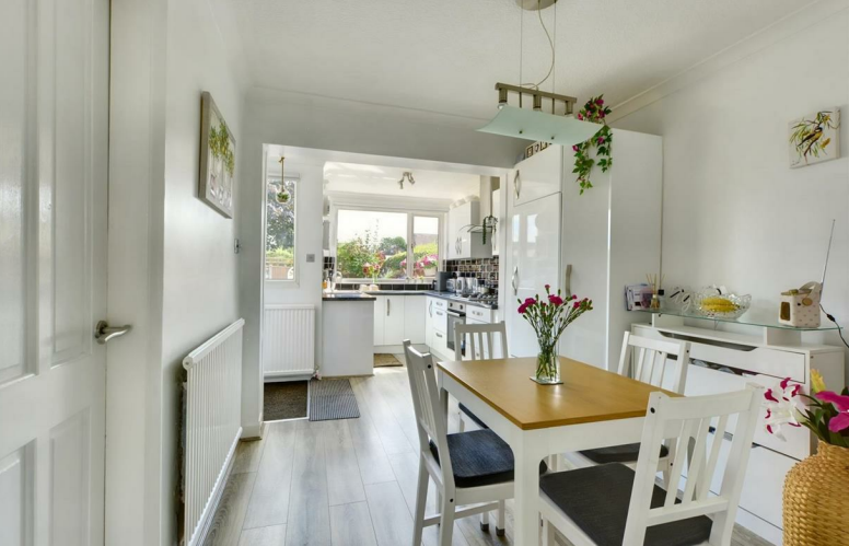
Dorothy Avenue Sandiacre, Nottingham NG10 5LH