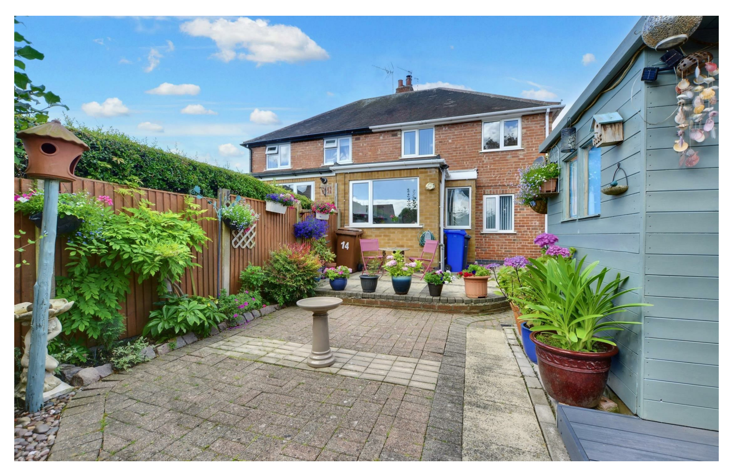
ROBERT ELLIS ARE DELIGHTED TO WELCOME TO THE MARKET THIS TRADITIONAL BAY FRONTED THREE BEDROOM, TWO BATHROOM SEMI DETACHED HOUSE SITUATED IN THIS POPULAR AND ESTABLISHED RESIDENTIAL LOCATION.

With accommodation over two floors, the ground floor comprises entrance hallway, bay fronted living room, spacious dining kitchen and modern bathroom. The first floor landing then provides access to three bedrooms with the principal bedroom benefitting from a three piece en-suite shower room.