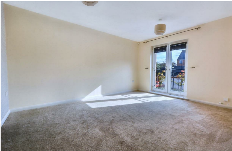
Bramble Court Sandiacre, Nottingham NG10 5QU