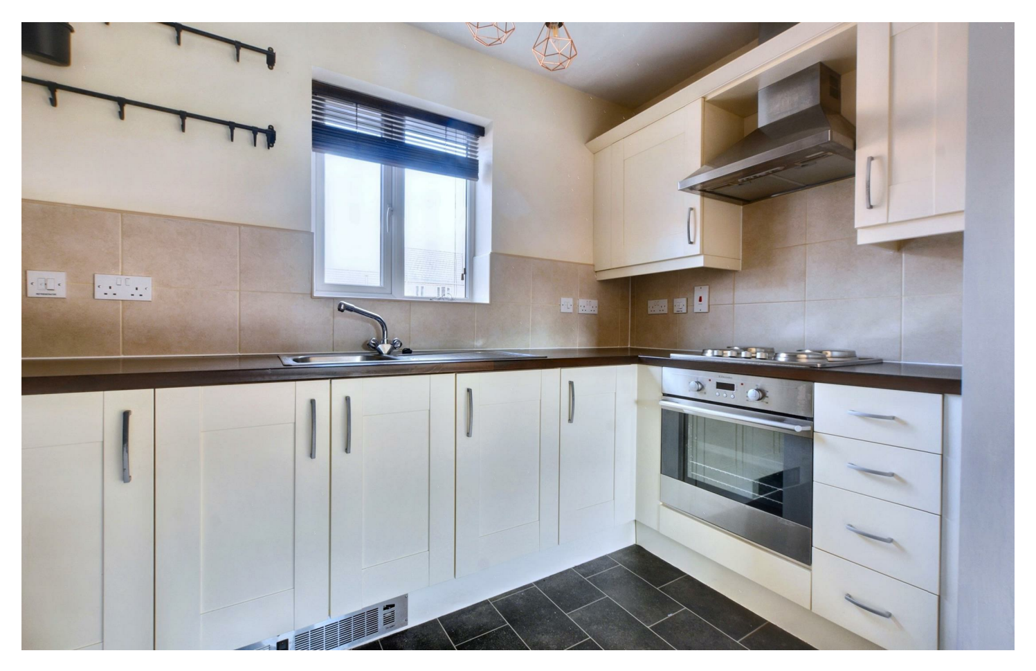
ROBERT ELLIS ARE DELIGHTED TO BRING TO THE MARKET THIS EXTREMELY WELL PRESENTED AND UNIQUE ONE DOUBLE BEDROOM DETACHED COACH HOUSE OFFERED FOR SALE WITH NO UPWARD CHAIN.

The property benefits from electric heating, allocated block paved parking space to the front, enclosed side garden and accommodation which is split over two floors with its own front entrance door.