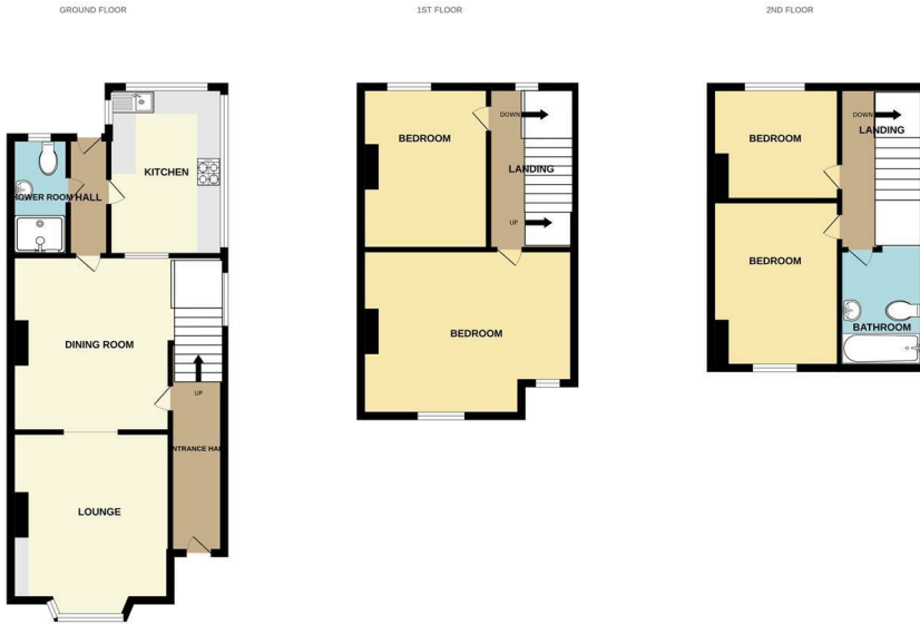
23 DERBY ROAD STAPLEFORD NG9 7AA

Whilst every attempt has been made to ensure the accuracy of the floorplan contained herein, measurements of doors, windows, rooms and any other items are approximate and no responsibility is taken for any error, omission or mis-statement. This plan is for illustrative purposes only and should be used as such by any prospective purchaser. The services, systems and appliances shown have not been tested and no guarantee as to their operability or efficiency can be given. Made with Metropix CS023