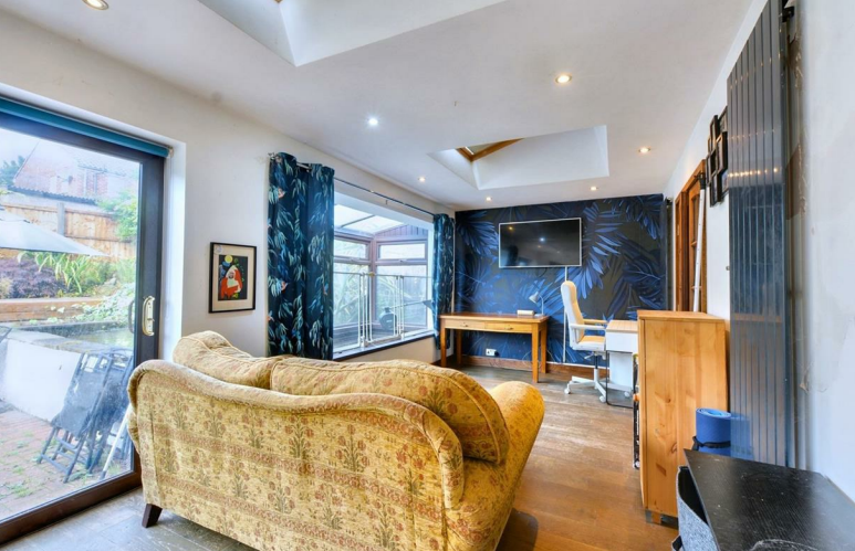
Coronation Avenue Sandiacre, Nottingham NG10 5ER