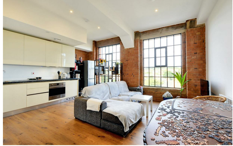
Springfield Mill Sandiacre, Nottingham NG10 5QD