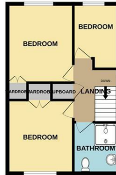
1ST FLOOR 429 sq ft. (39.9 sq.m.) approx.