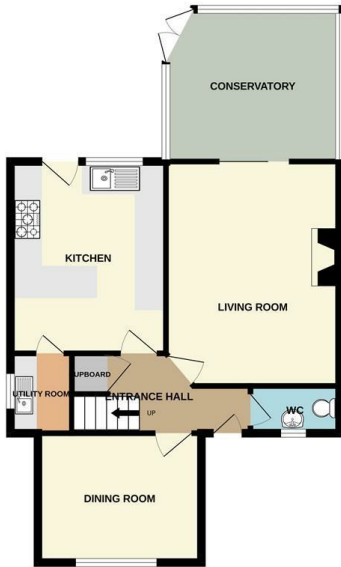
GROUND FLOOR 645 sq.ft. (59.9 sq.m.) approx.