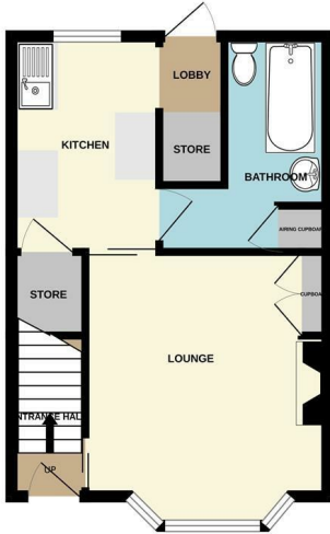
GROUND FLOOR 350 sq.ft. (32.5 sq.m.) approx.