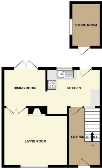
GROUND FLOOR 463 sq.ft. (43.0 sq.m.) approx.