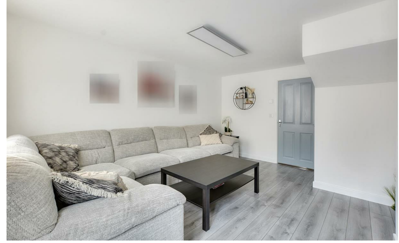
Slater Way Ilkeston, Derbyshire DE7 4SL