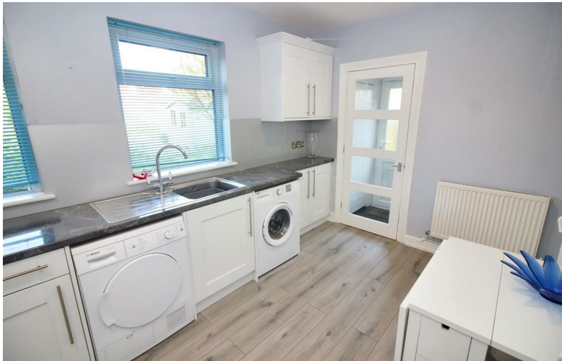
Cambridge Crescent Stapleford, Nottingham NG9 8GX