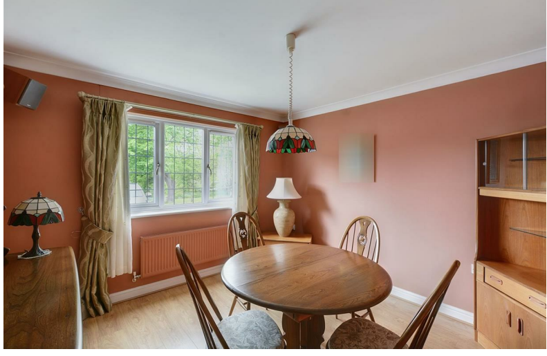
Risley Hall Risley, Derby DE72 3WP