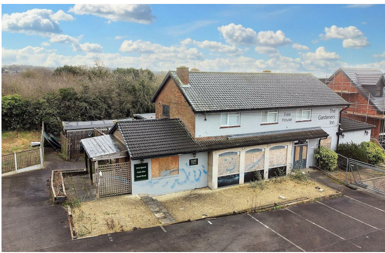
Awsworth Lane Cossall, Nottingham NG16 2RZ