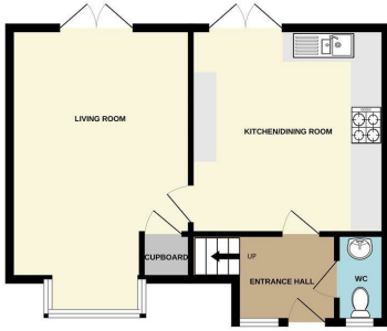
GROUND FLOOR 482 sq.ft. (44.8 sq.m.) approx.