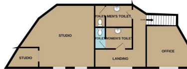
1ST FLOOR 696 sq.ft. (64.7 sq.m.) approx.