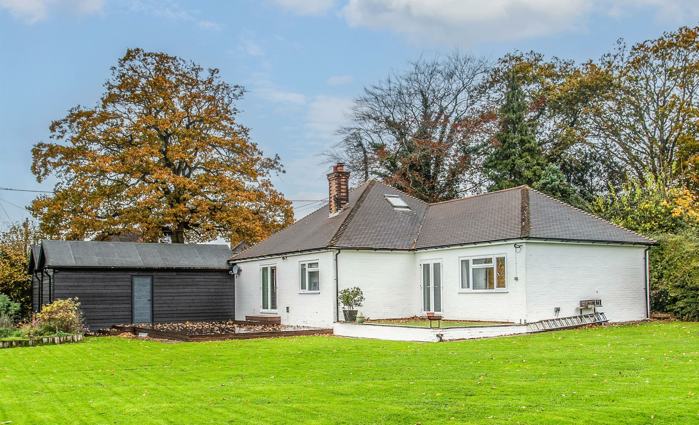
Harvesters, Framfield, TN22 5PN