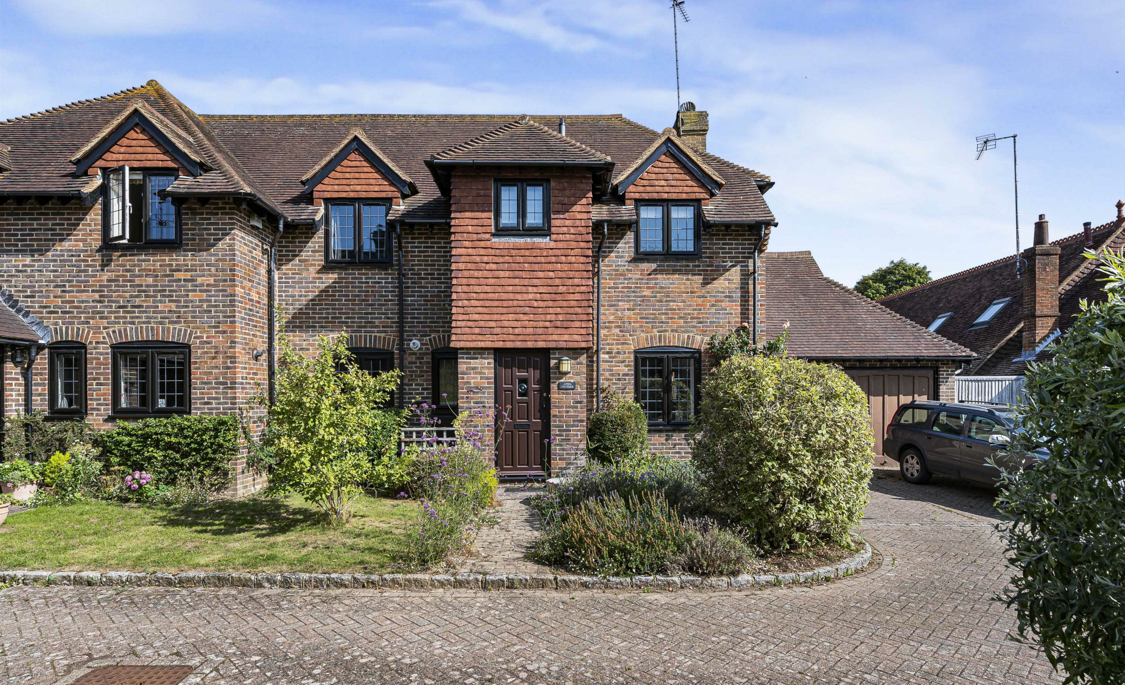
Anvil Cottage West Street, Alfriston, BN26 5UX