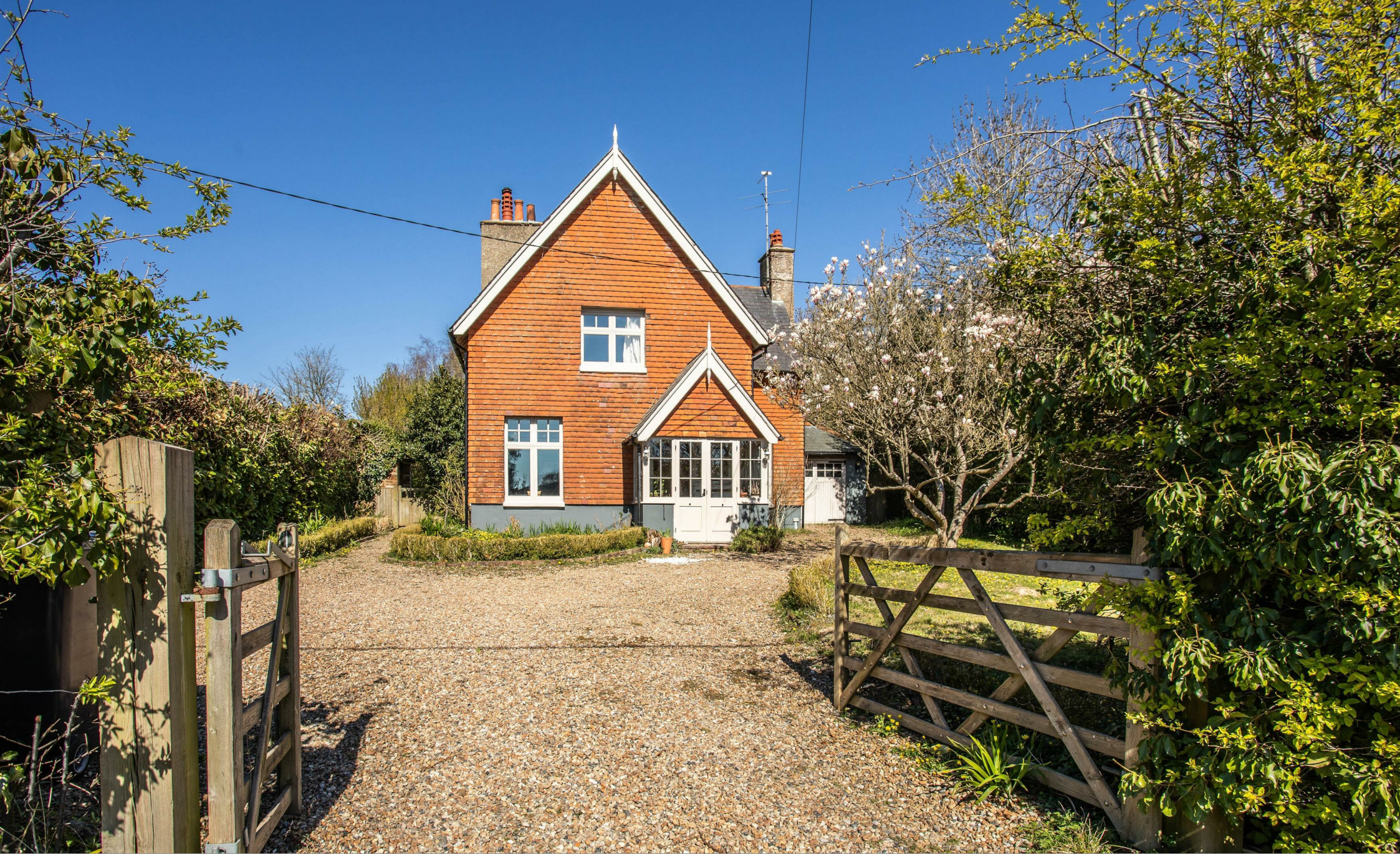
School House, Muddles Green, Chiddingly, Lewes, BN8 6HN