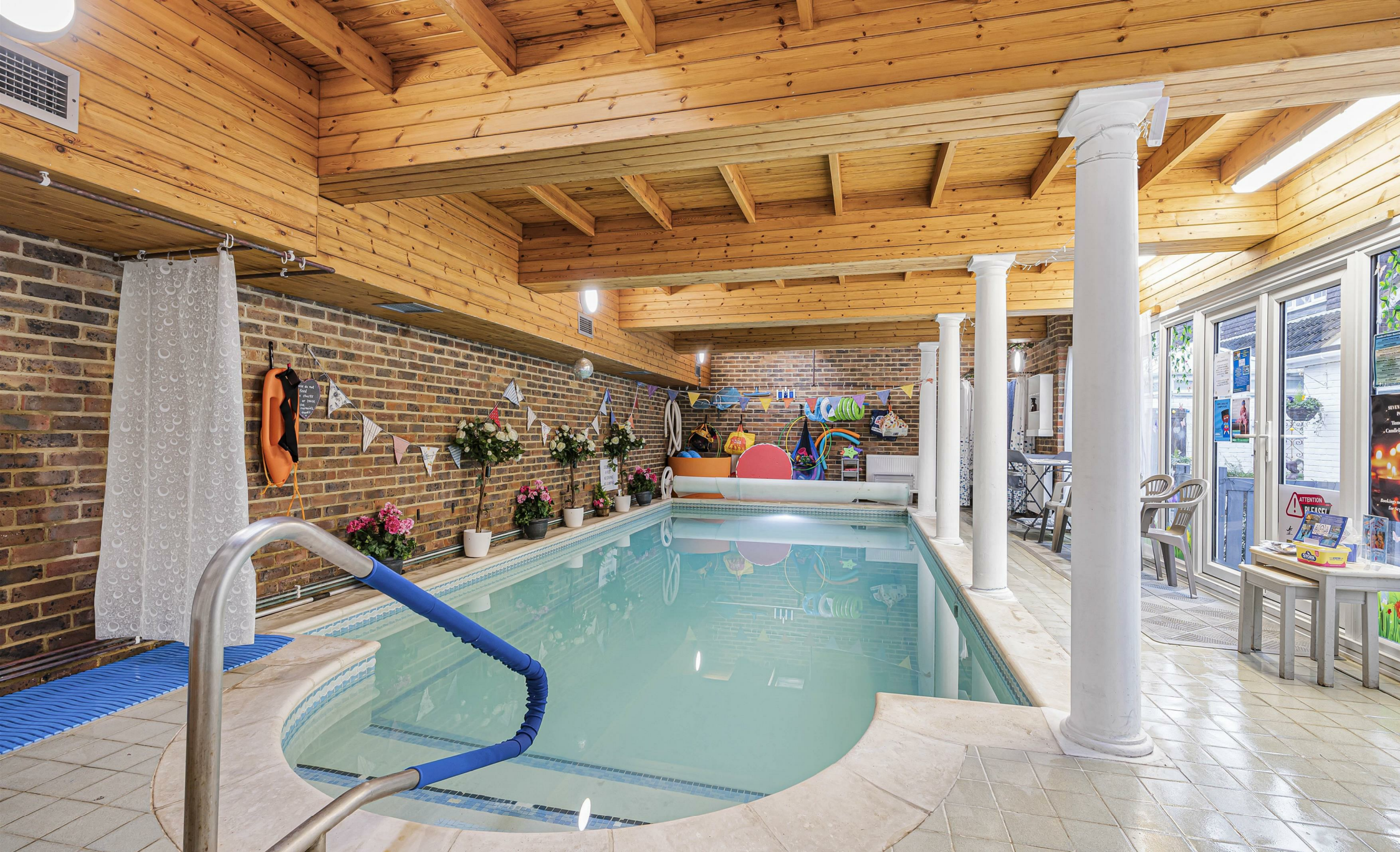
Swimming Pool, Chyngton Way, Seaford, BN25 4JE