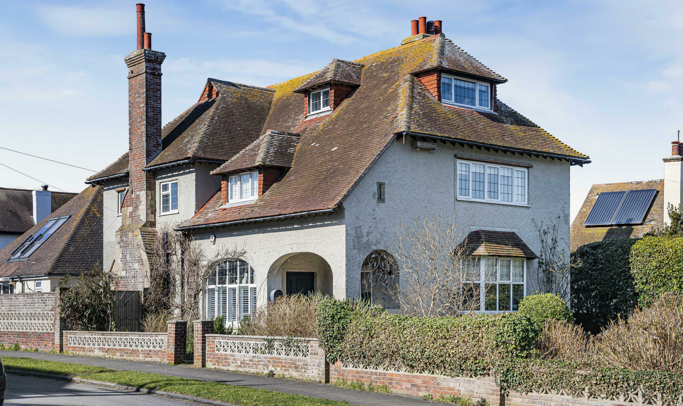
The Trees, 29 Corsica Road, Seaford, BN25 1BD