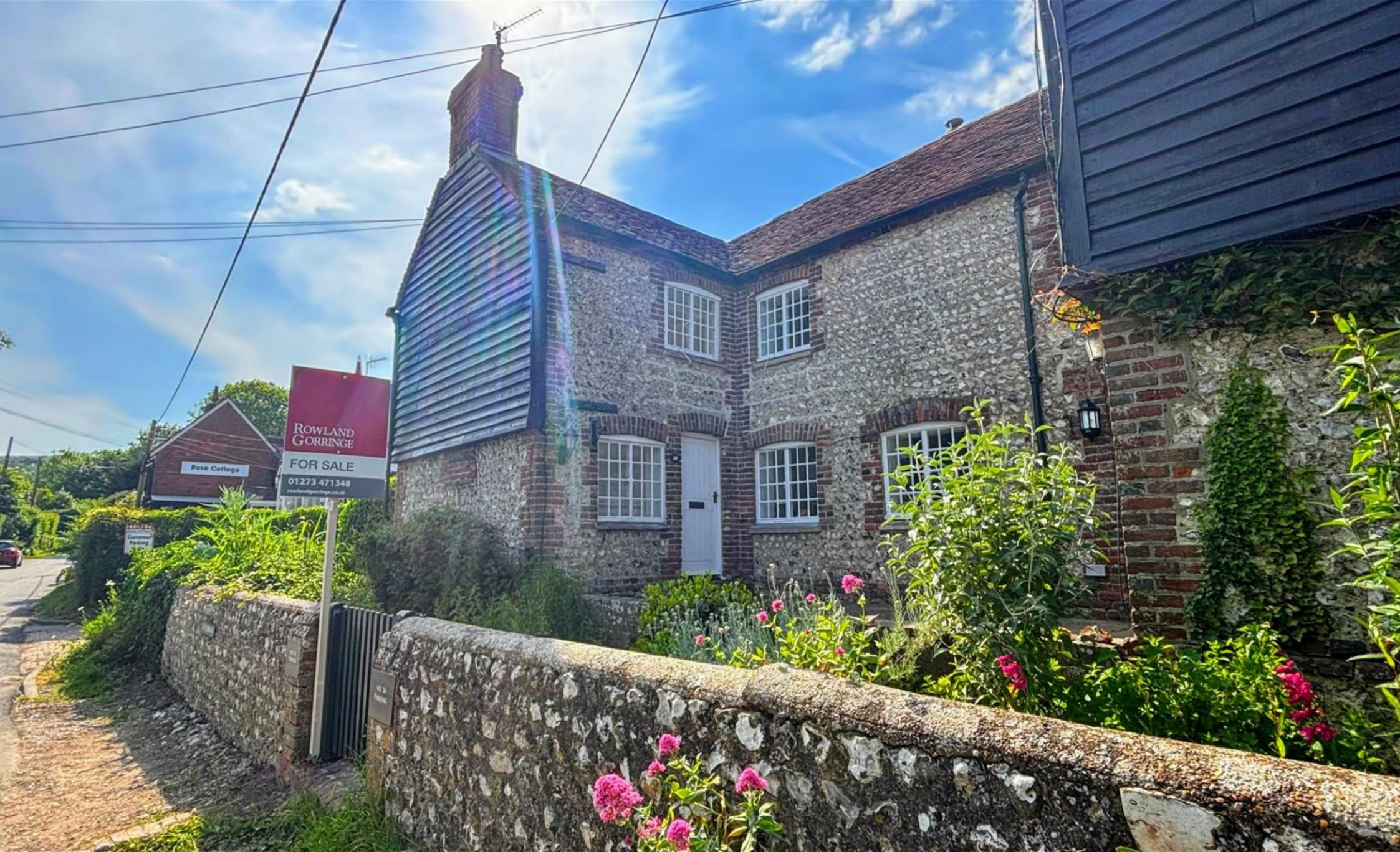
36 The Square, The Village, Alciston, East Sussex, BN26 6UT