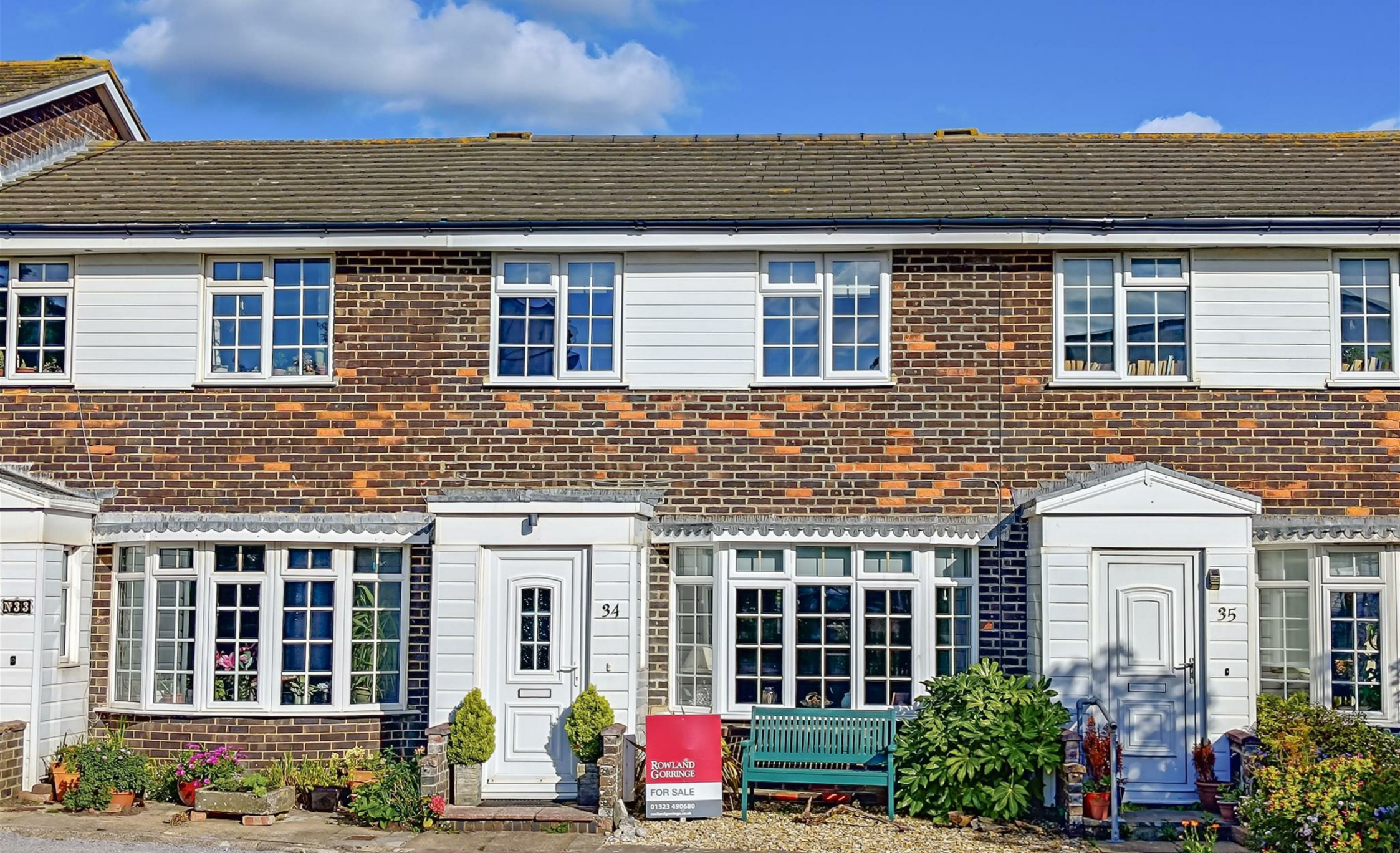
34 Bramber Close, Crooked Lane, Seaford, BN25 1QB