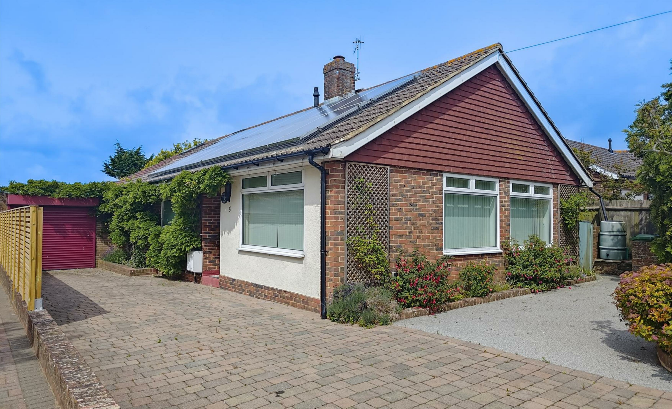
Badgers Dene 5 Chyngton Lane North, Seaford, BN25 3UU