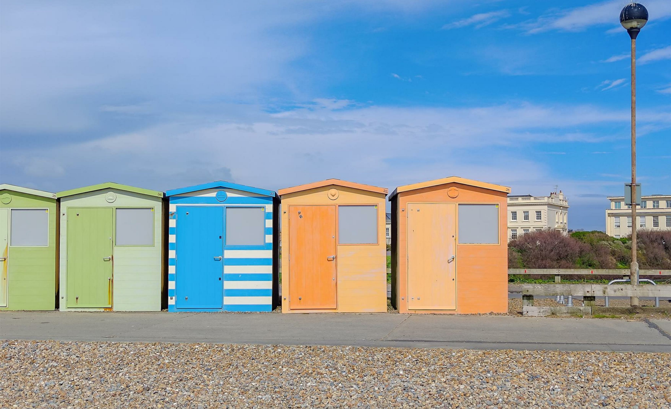
32 Beach Hut, Eastern Parade Esplanade, Seaford, BN25 1JL