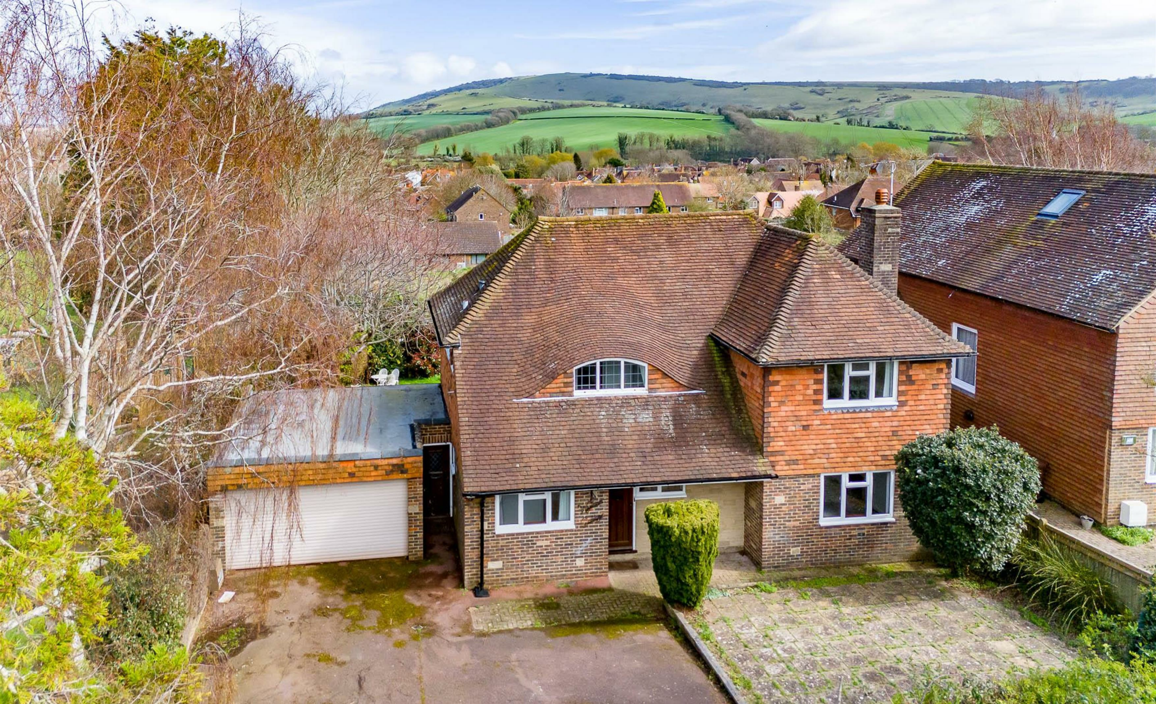
Wytham Cottage The Broadway, Alfriston, East Sussex, BN26 5XH