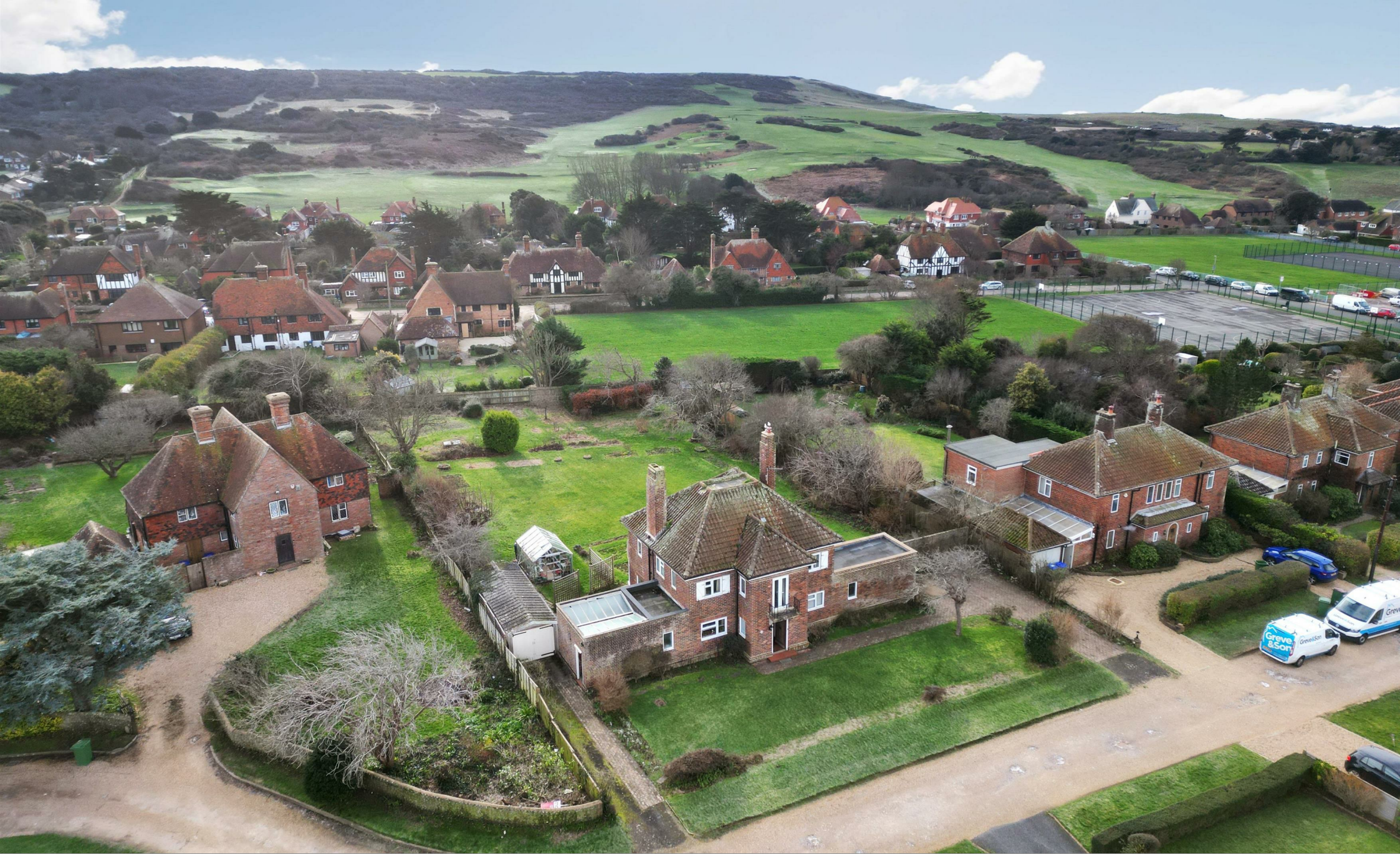
Kenmare, 12 Green Walk, Seaford, East Sussex, BN25 4LY