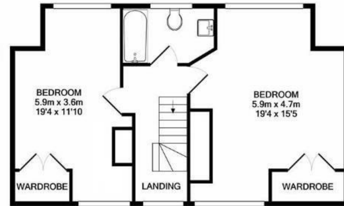
1ST FLOOR APPROX. FLOOR AREA 56.3 SQ.M. (606 SQ.FT.)