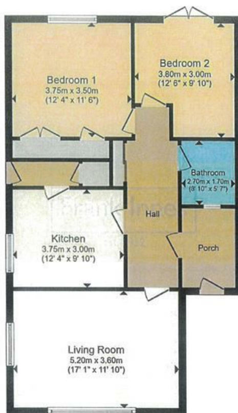
Floorplan for 2 bedroom bungalow for sale

Total floor area 76.0 m 2 (818 sq.ft.) approx