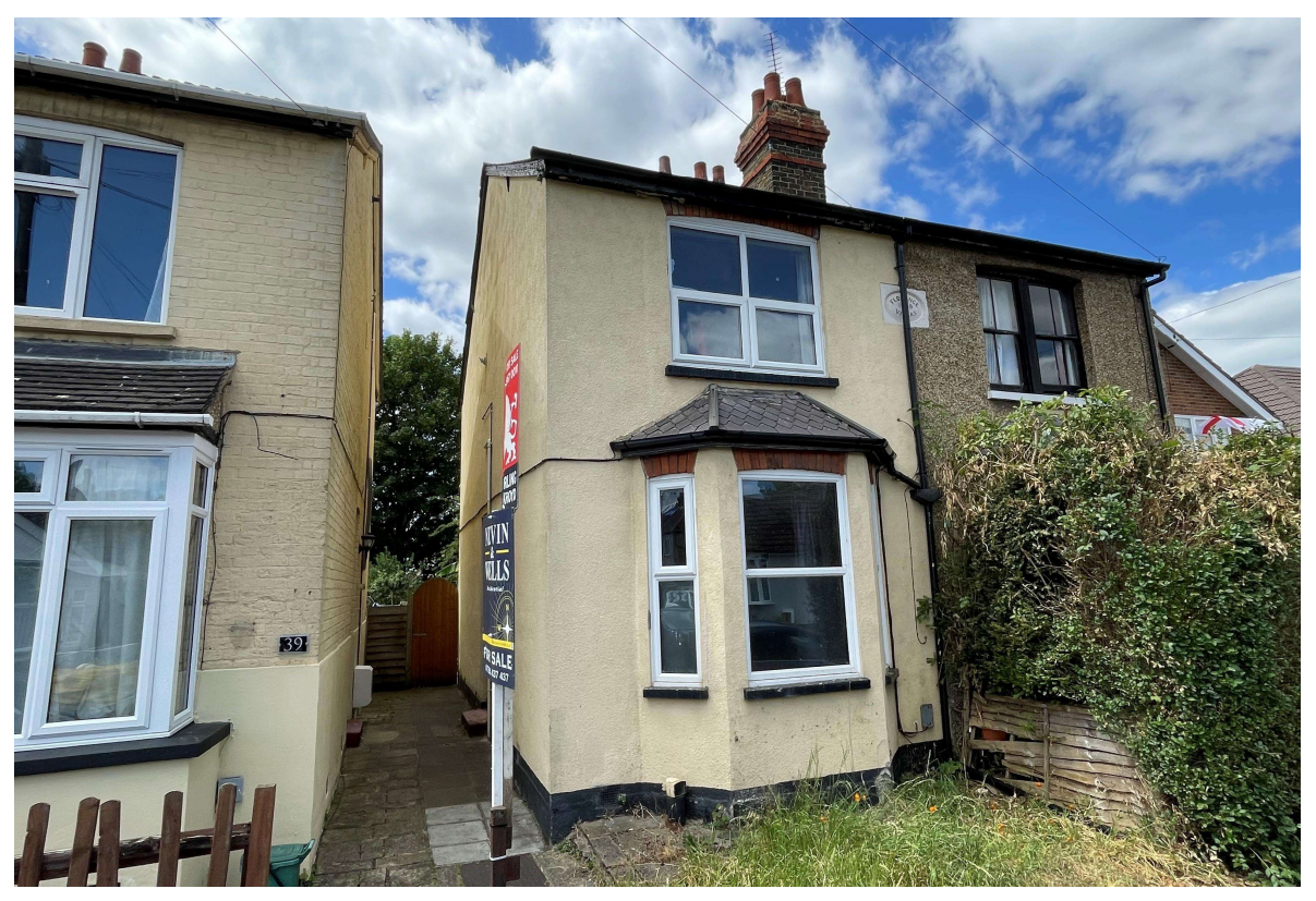
Hythe Park Road, Egham, TW20 8BW